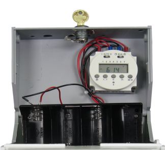
Drain Chief's battery pack nests inside locking, splash resistant cabinet